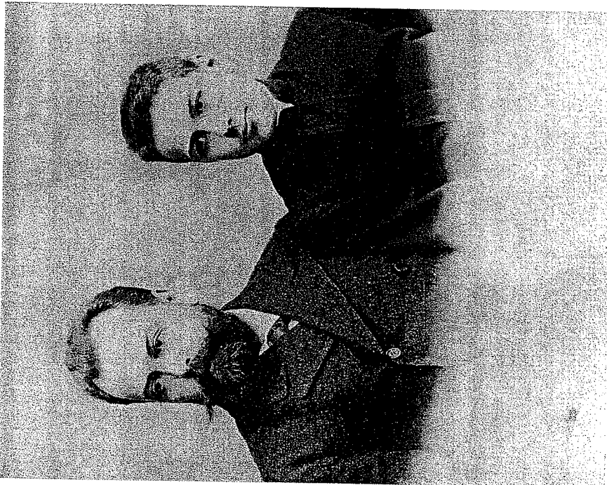
Figure 3. Sergei Nilus, pictured with his son about 1900

a professor of political science, who, in his book on the Protocols , erroneously introduces Nilus as “the son of Swiss émigrés who had entered Russia during the reign of Peter I.” 10 If that were true, the Nilus of the early twentieth century would have been almost two hundred years old.